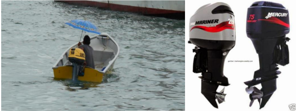
Fig. 1 Boat engine

Boat engine is one type of internal combustion engine that is used as a driving machine on the boat crossing. This type of machine uses gasoline. The structure and the application of boat engine are presented on Fig 1.